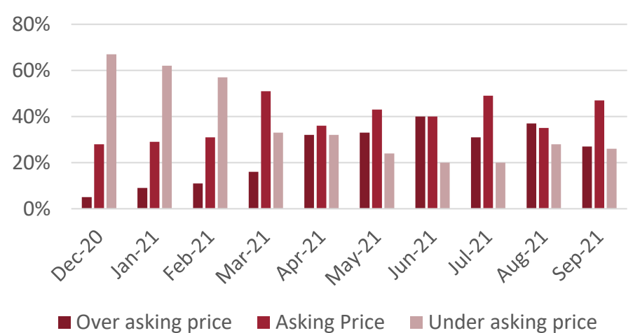
Figure 1: What Properties Sold For

In September, the majority of homes agreed sales at the original asking price (47 per cent). This is a shift away from properties predominantly selling for over the asking price in August. In August 37 per cent of homes sold for over the asking price. Conversely, in September, just 27 per cent of properties sold for more than asking price. Before March 2021 it had been the norm for the majority of properties to agree sales at under asking price.